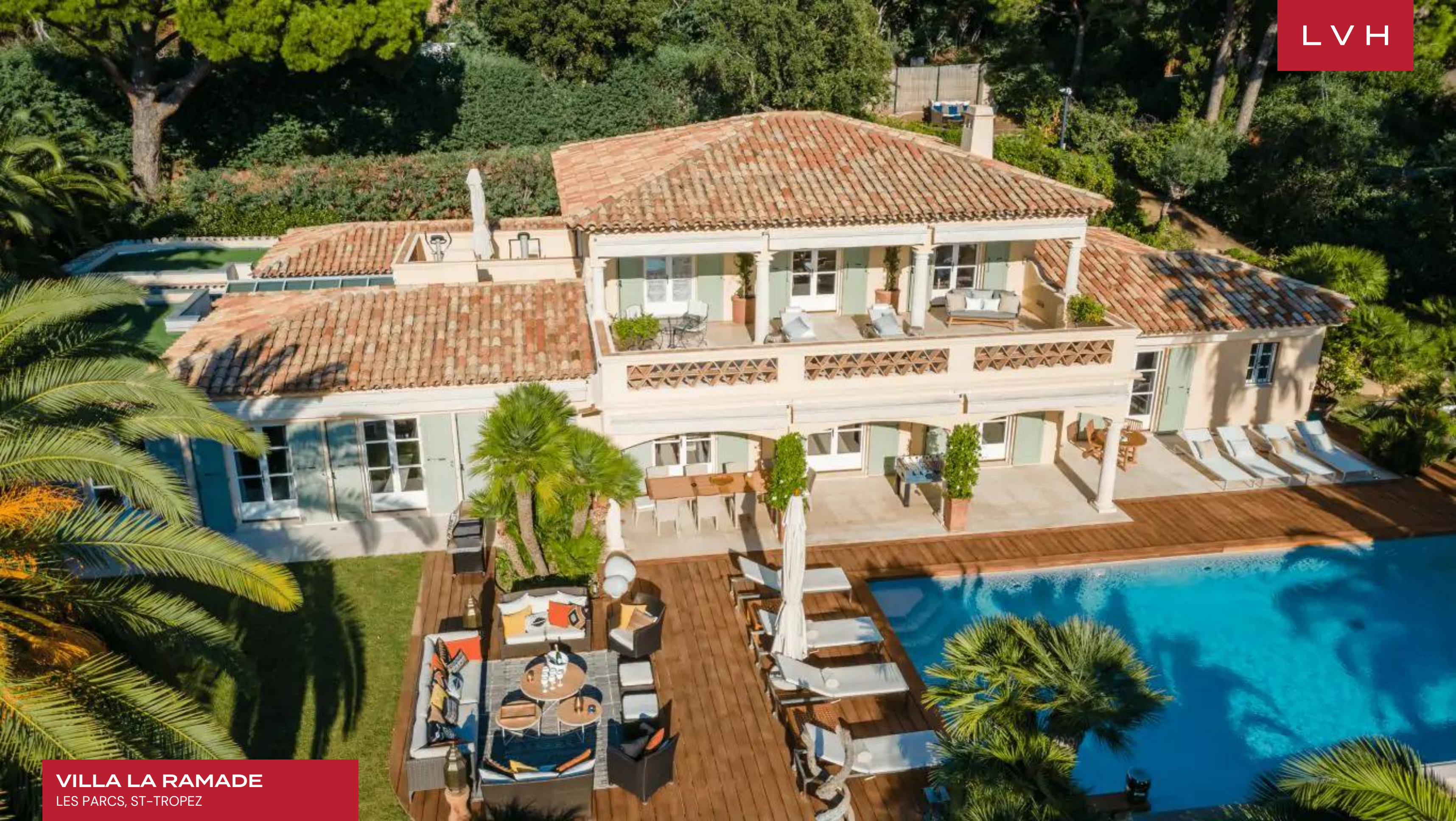
VILLA LA RAMADE LES PARCS, ST-TROPEZ