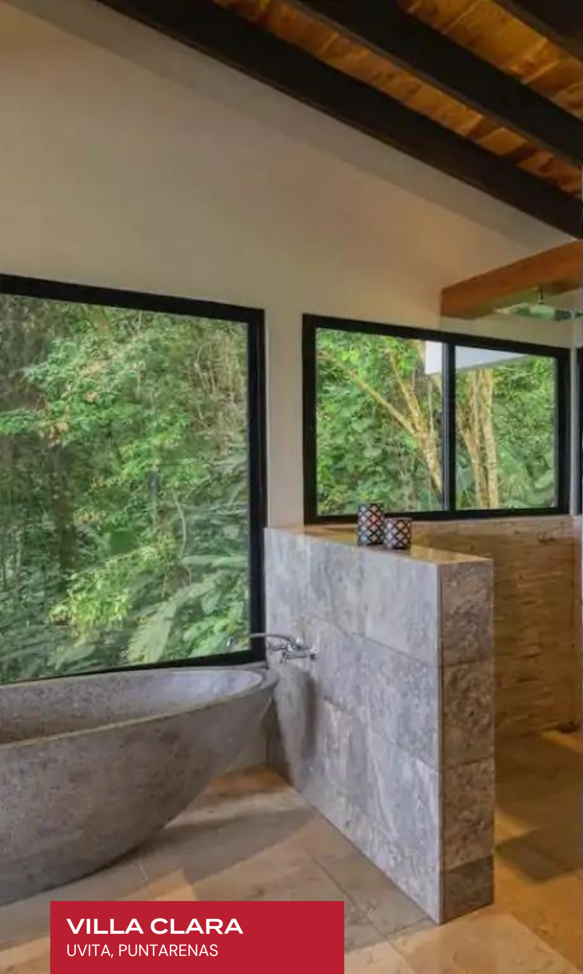
VILLA CLARA UVITA, PUNTARENAS