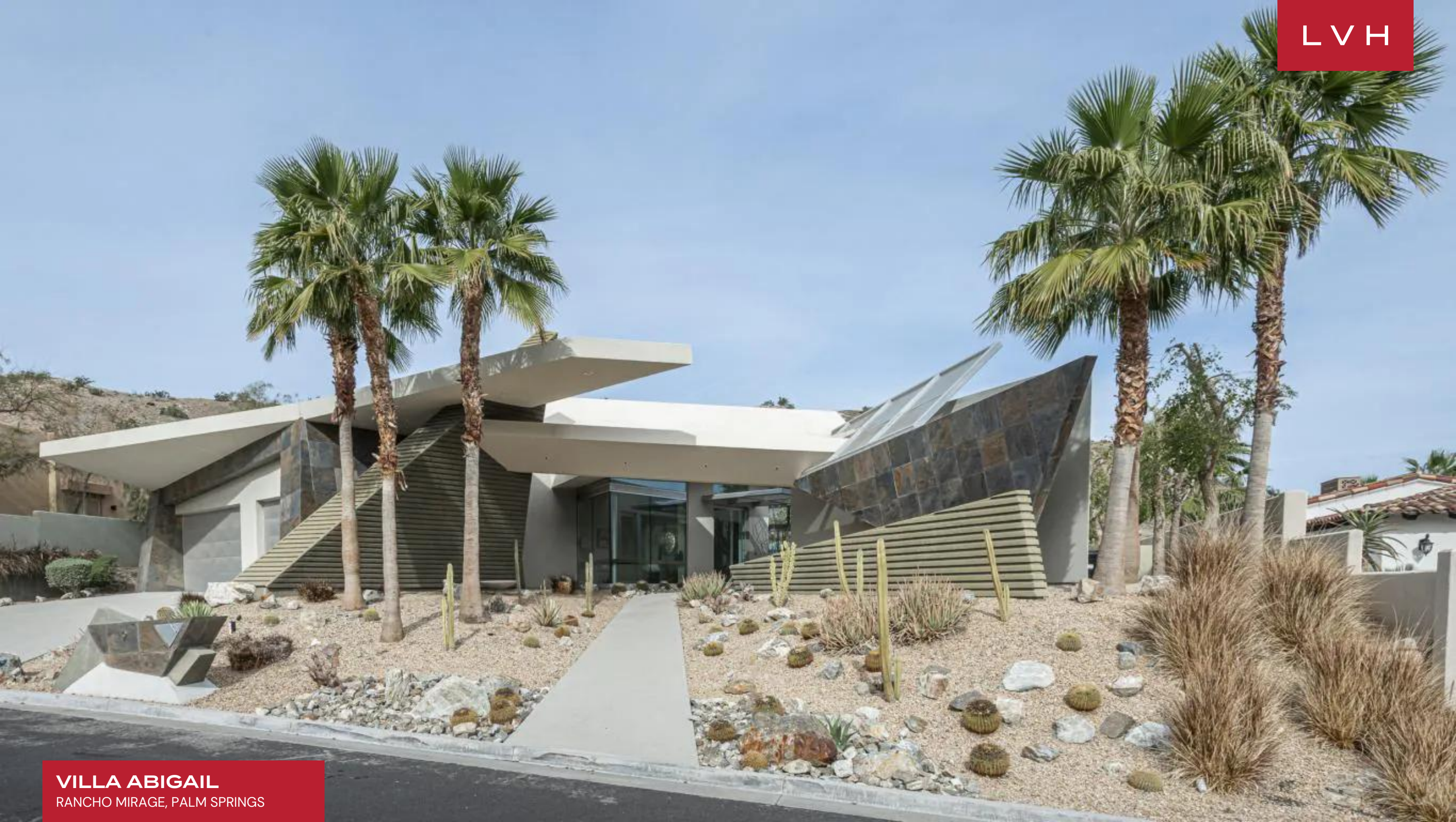
VILLA ABIGAIL RANCHO MIRAGE, PALM SPRINGS