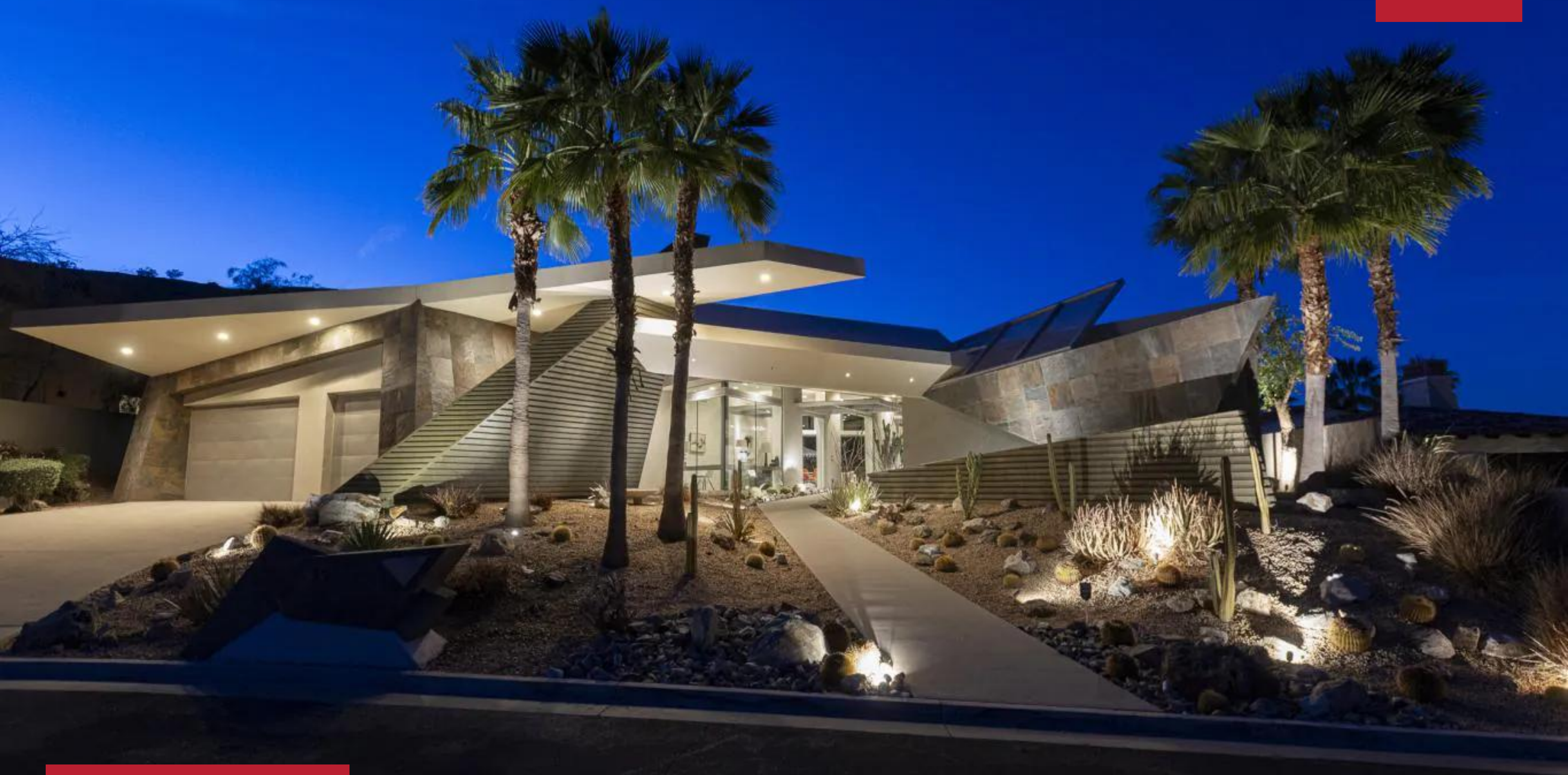
VILLA ABIGAIL RANCHO MIRAGE, PALM SPRINGS