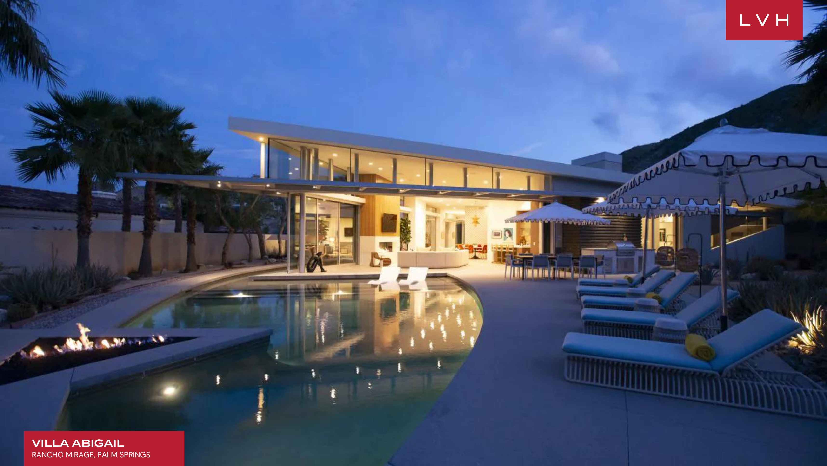
VILLA ABIGAIL RANCHO MIRAGE, PALM SPRINGS