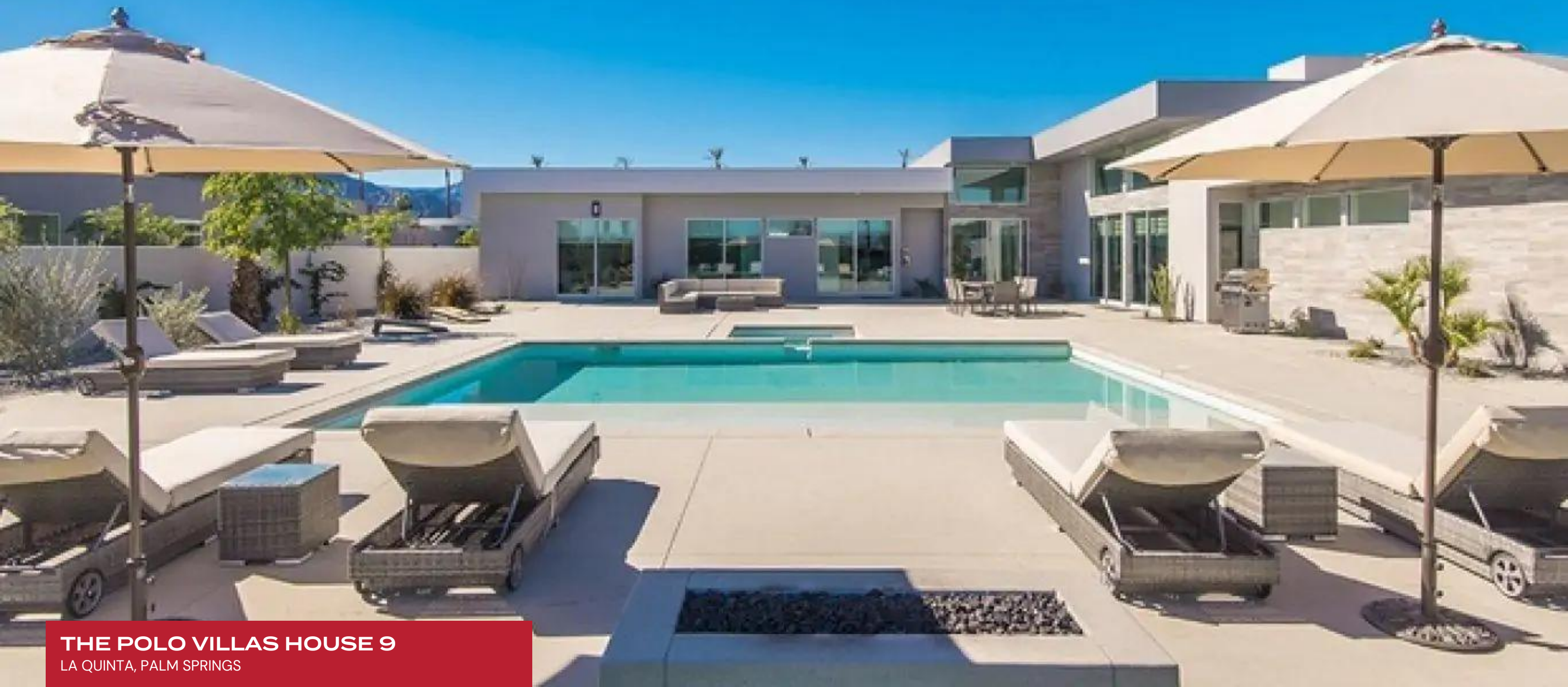
THE POLO VILLAS HOUSE 9 LA QUINTA, PALM SPRINGS