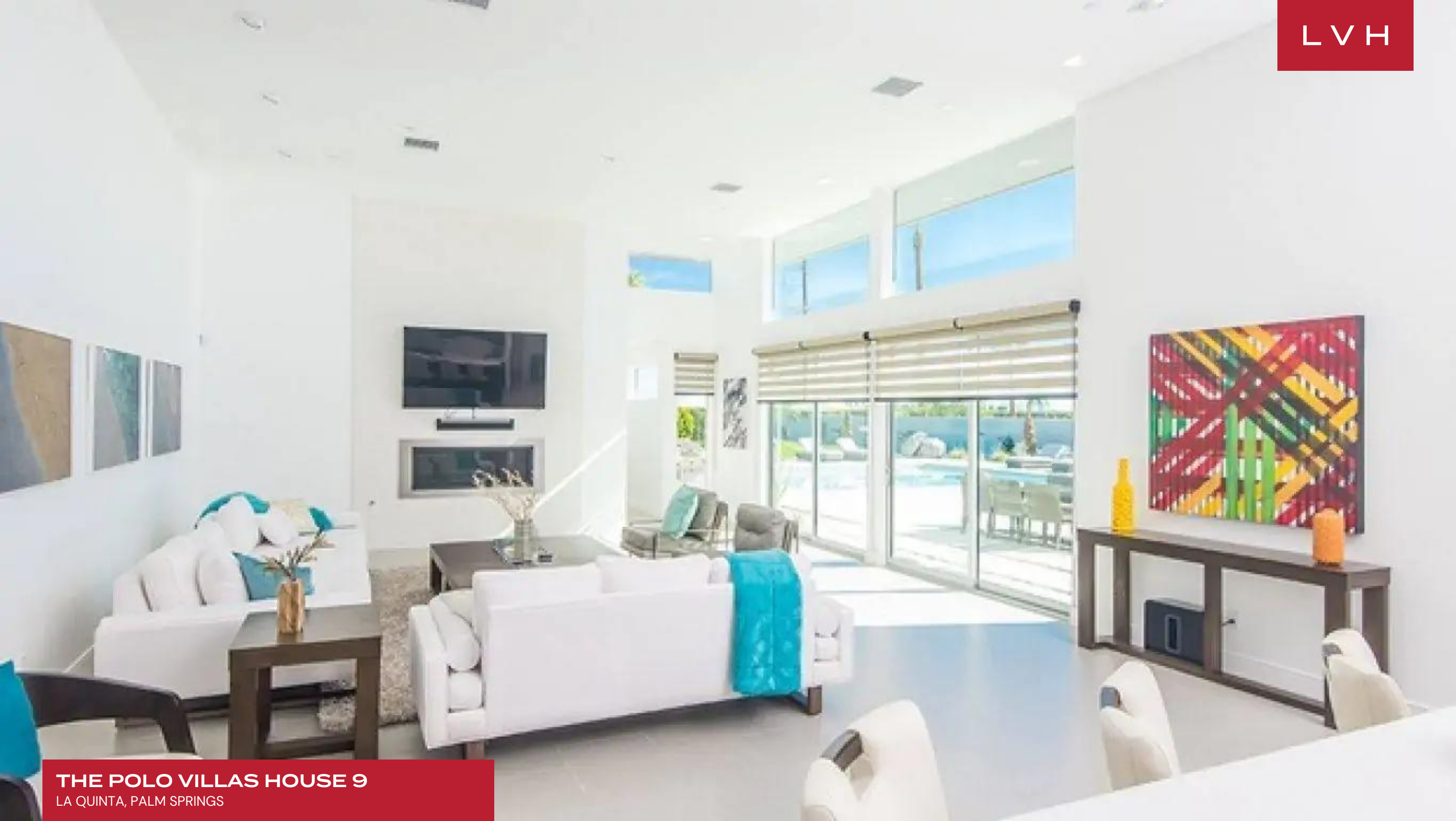
THE POLO VILLAS HOUSE 9 LA QUINTA, PALM SPRINGS