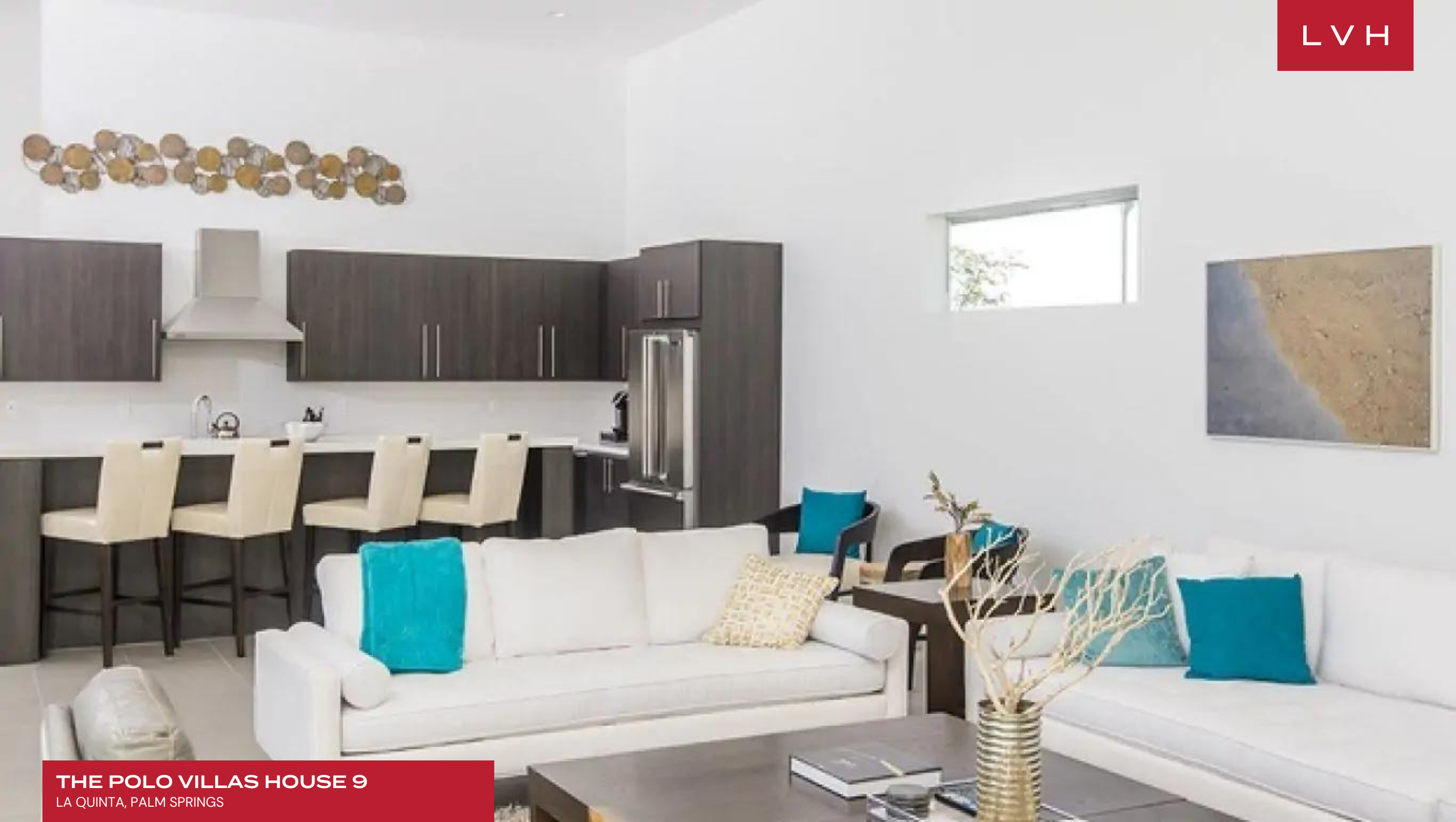
THE POLO VILLAS HOUSE 9 LA QUINTA, PALM SPRINGS