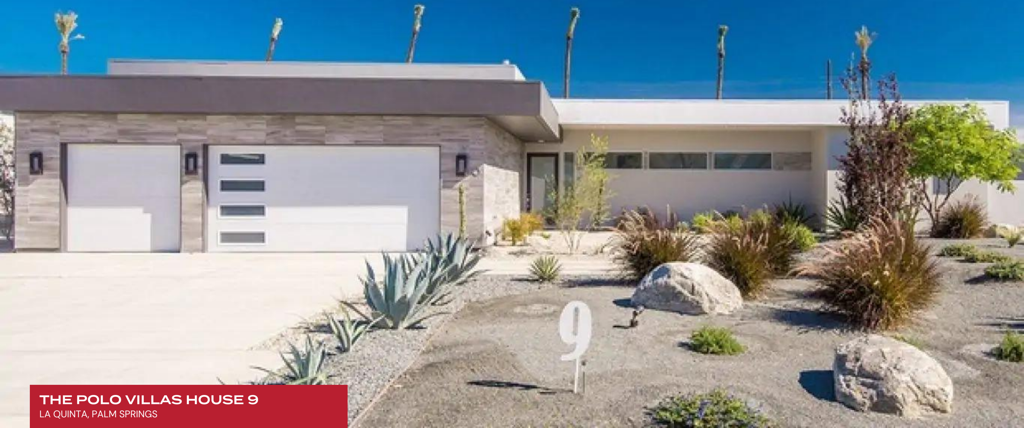
THE POLO VILLAS HOUSE 9 LA QUINTA, PALM SPRINGS