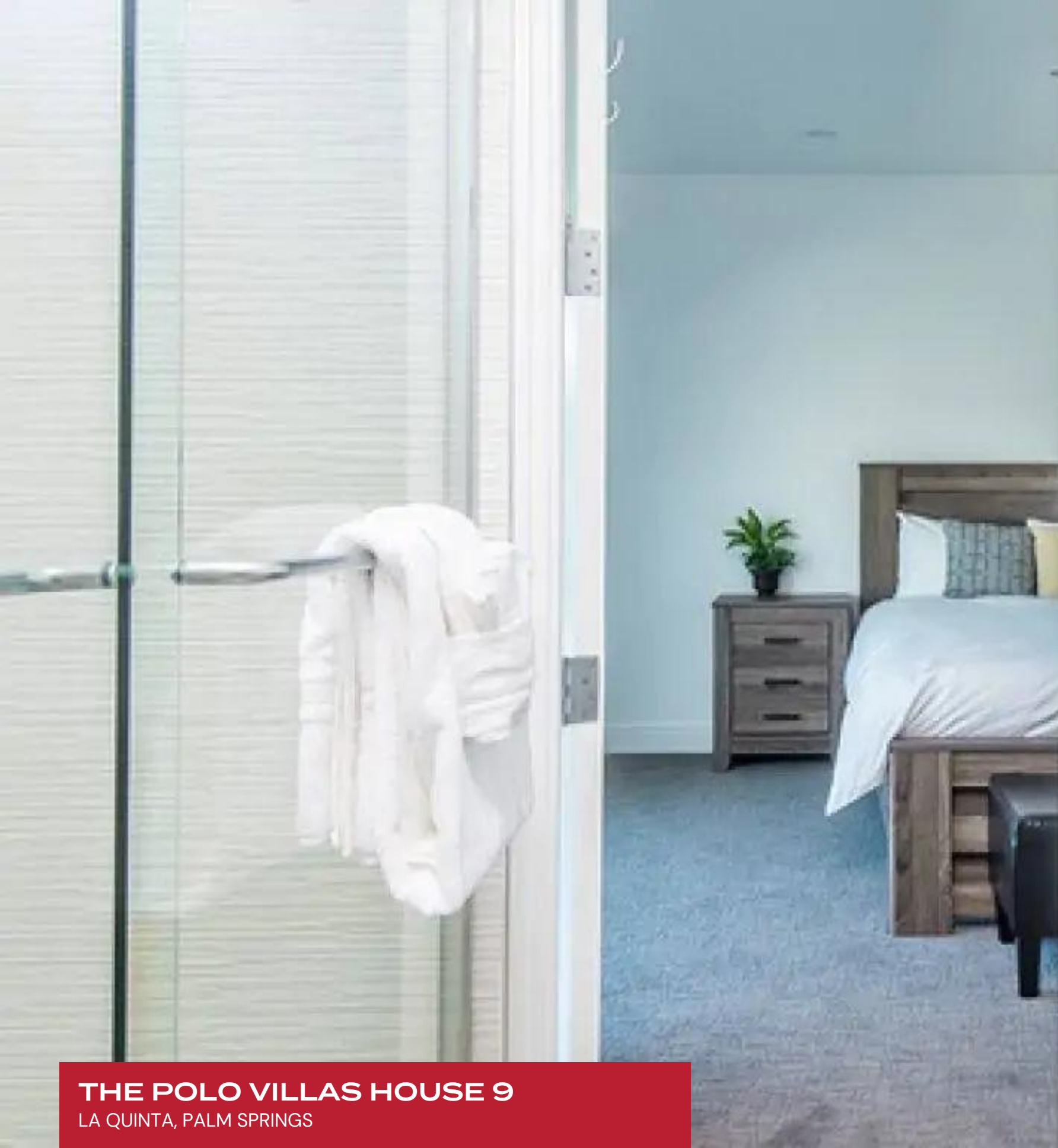
THE POLO VILLAS HOUSE 9 LA QUINTA, PALM SPRINGS