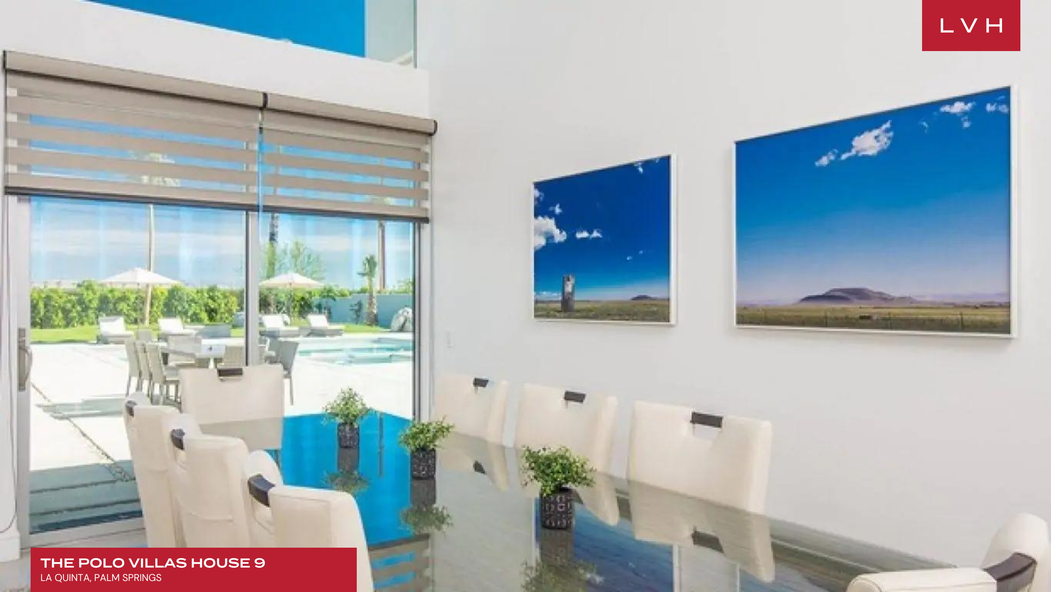
THE POLO VILLAS HOUSE 9 LA QUINTA, PALM SPRINGS