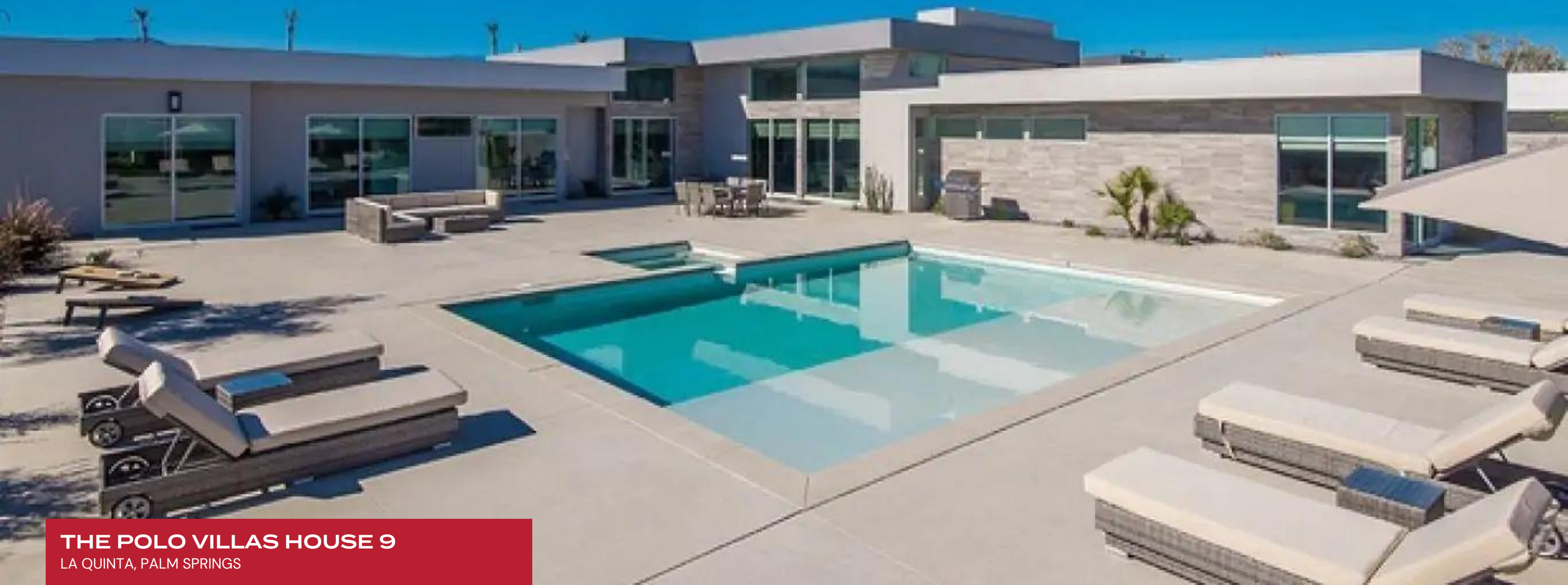
THE POLO VILLAS HOUSE 9 LA QUINTA, PALM SPRINGS