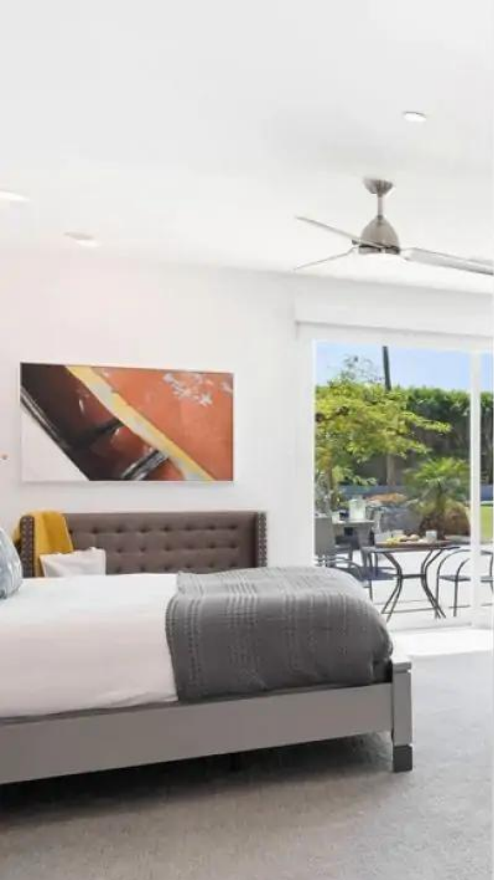
THE POLO VILLAS HOUSE 3 LA QUINTA, PALM SPRINGS