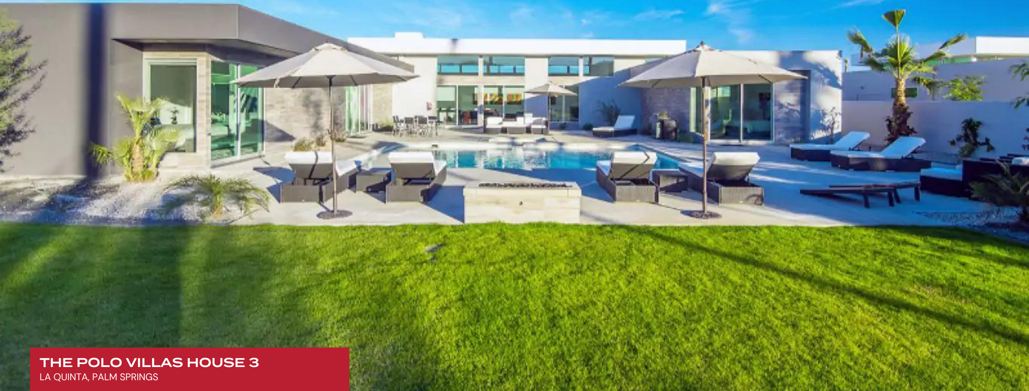
THE POLO VILLAS HOUSE 3 LA QUINTA, PALM SPRINGS