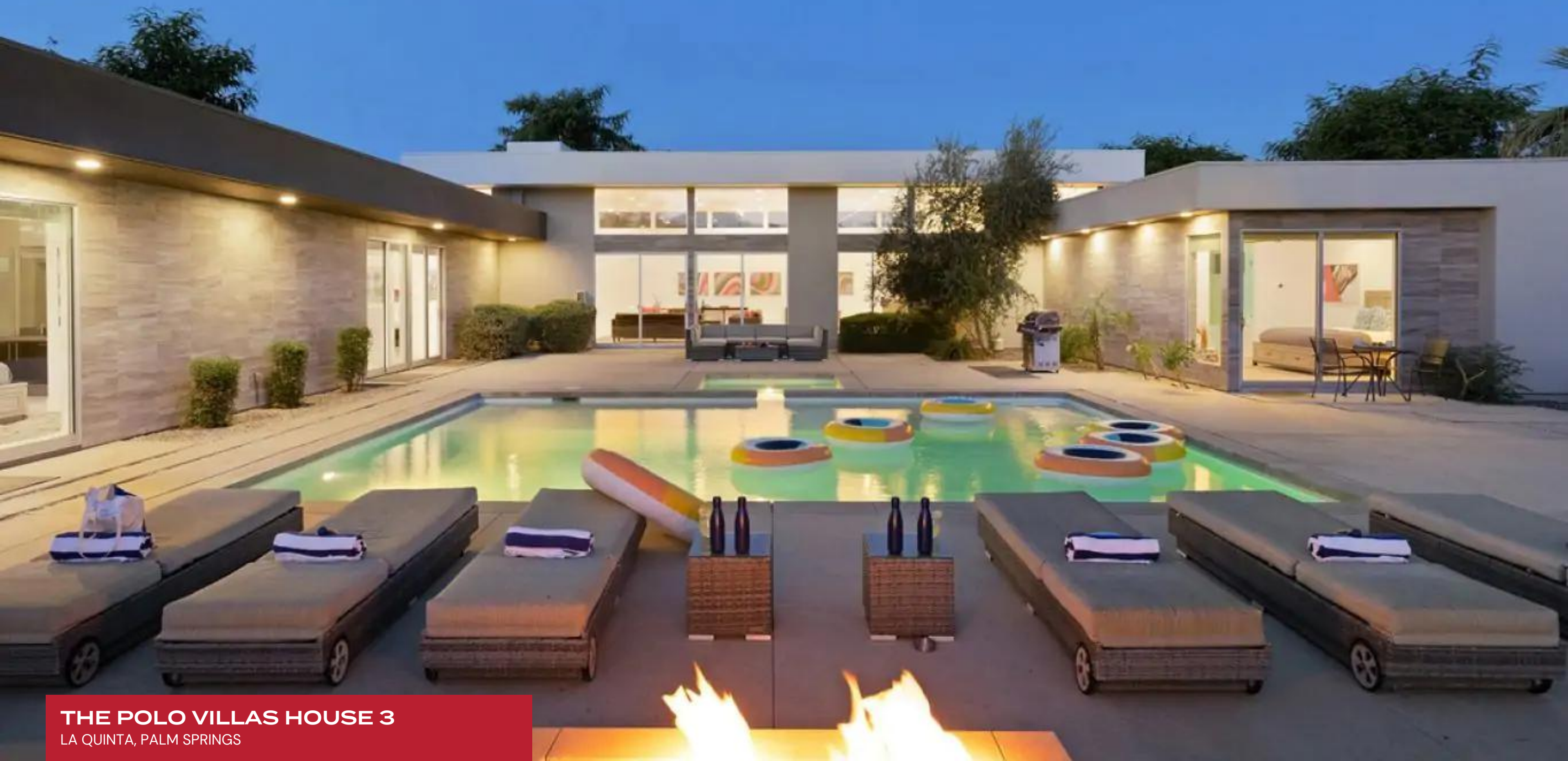
THE POLO VILLAS HOUSE 3 LA QUINTA, PALM SPRINGS