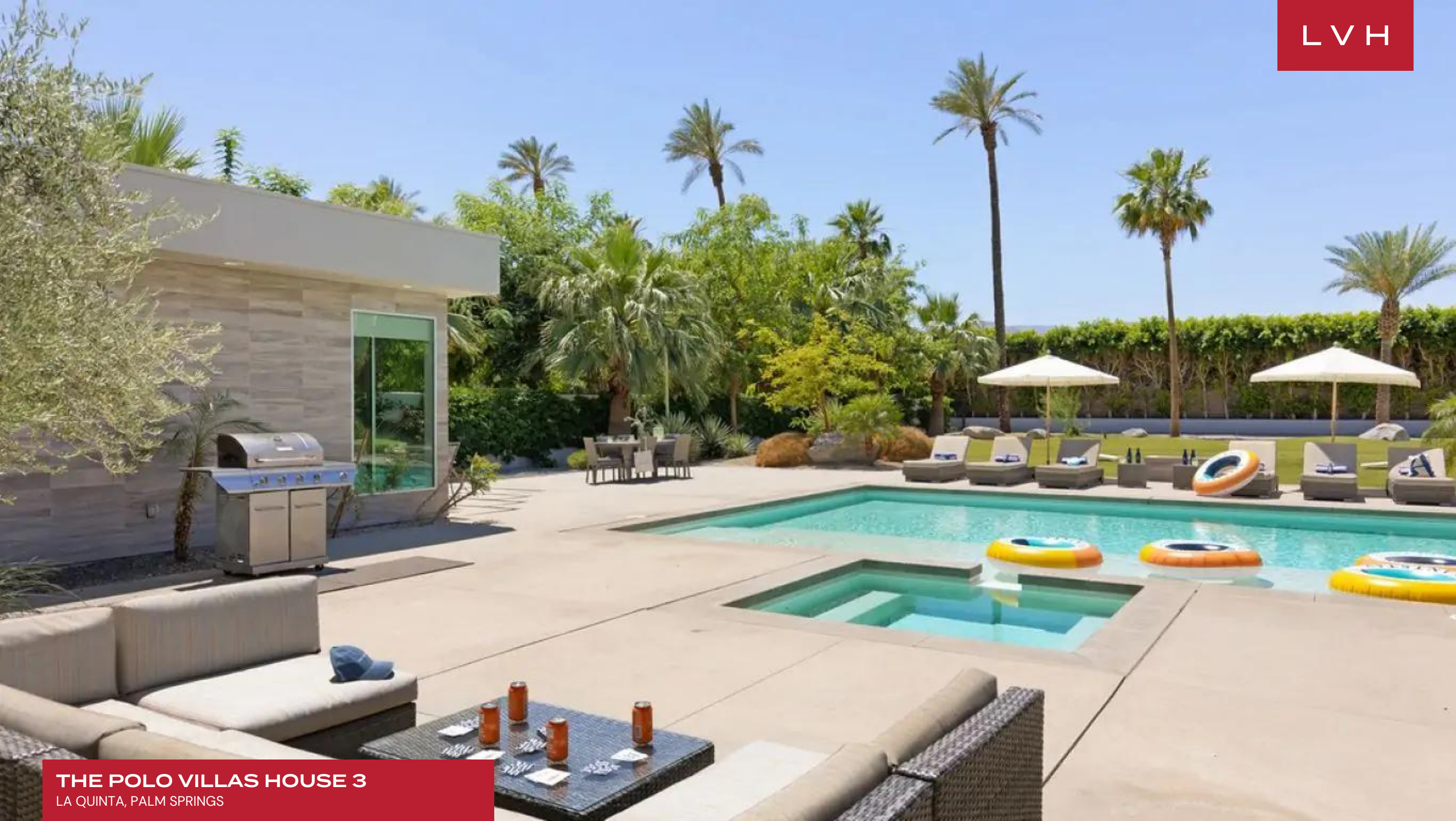
THE POLO VILLAS HOUSE 3 LA QUINTA, PALM SPRINGS