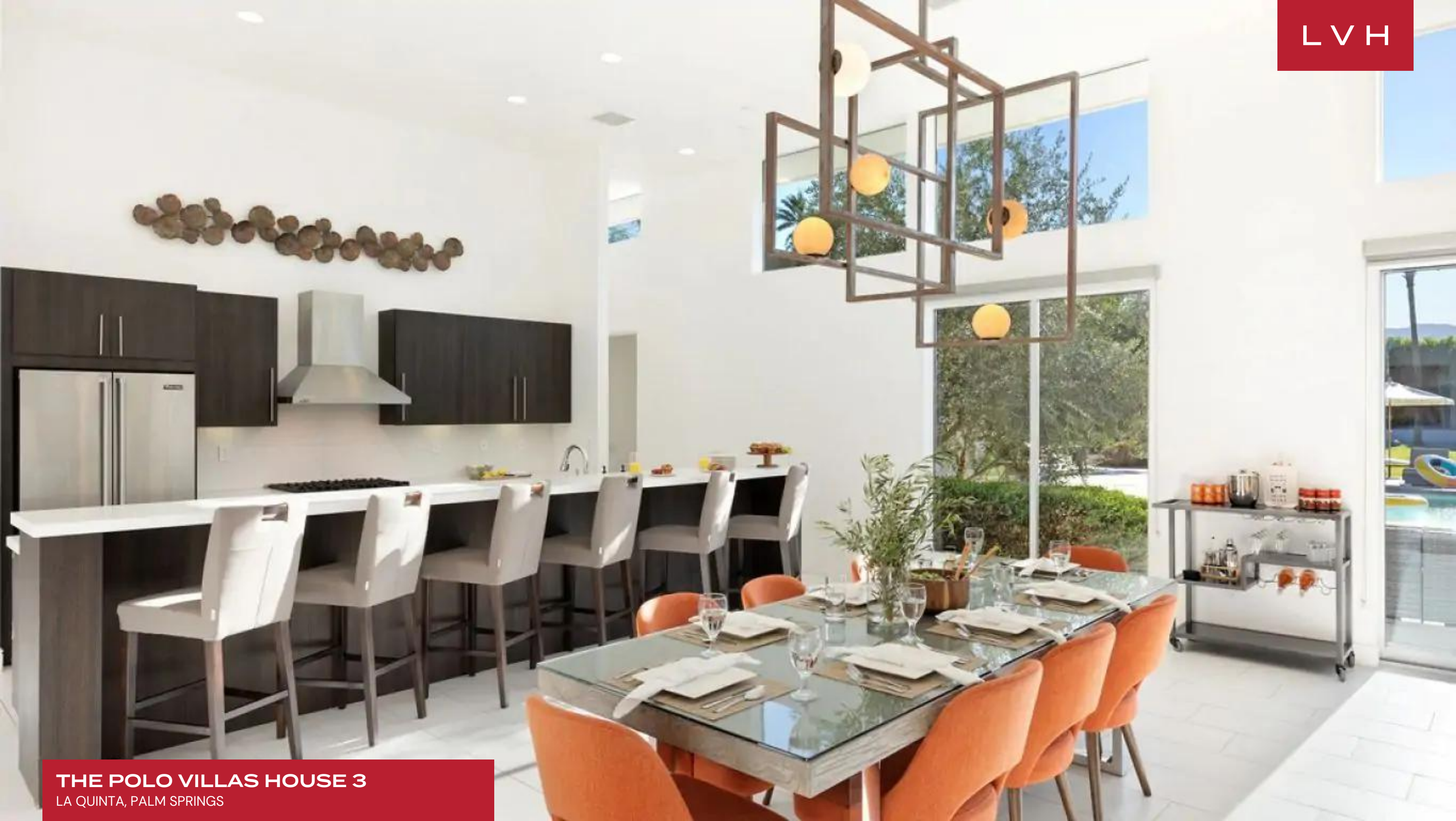
THE POLO VILLAS HOUSE 3 LA QUINTA, PALM SPRINGS