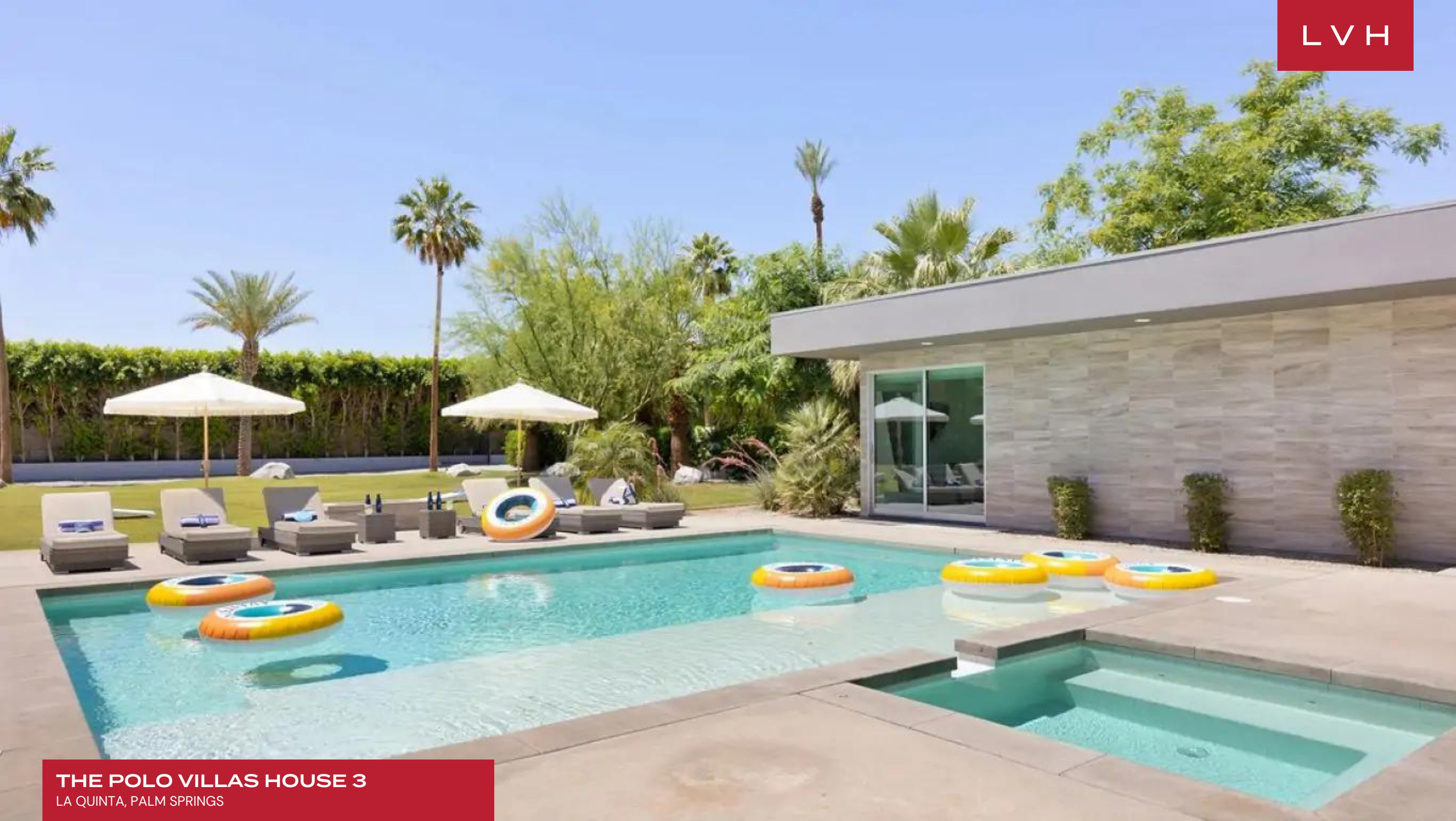
THE POLO VILLAS HOUSE 3 LA QUINTA, PALM SPRINGS