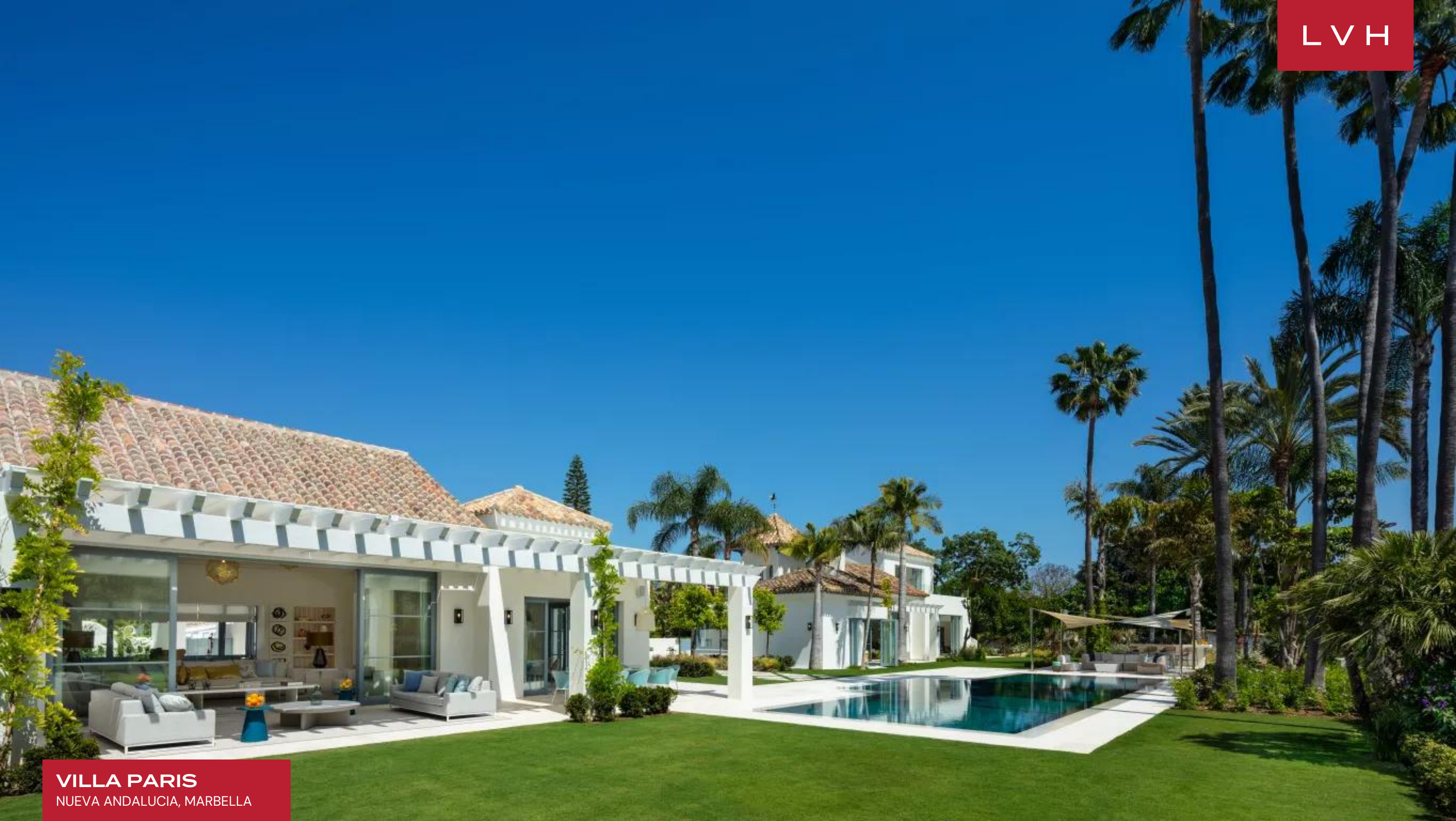
VILLA PARIS NUEVA ANDALUCIA, MARBELLA