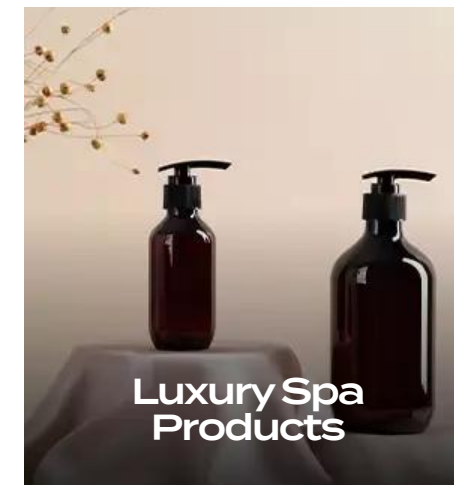
Luxury Spa Products