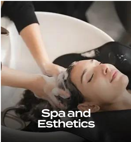
Spa and Esthetics