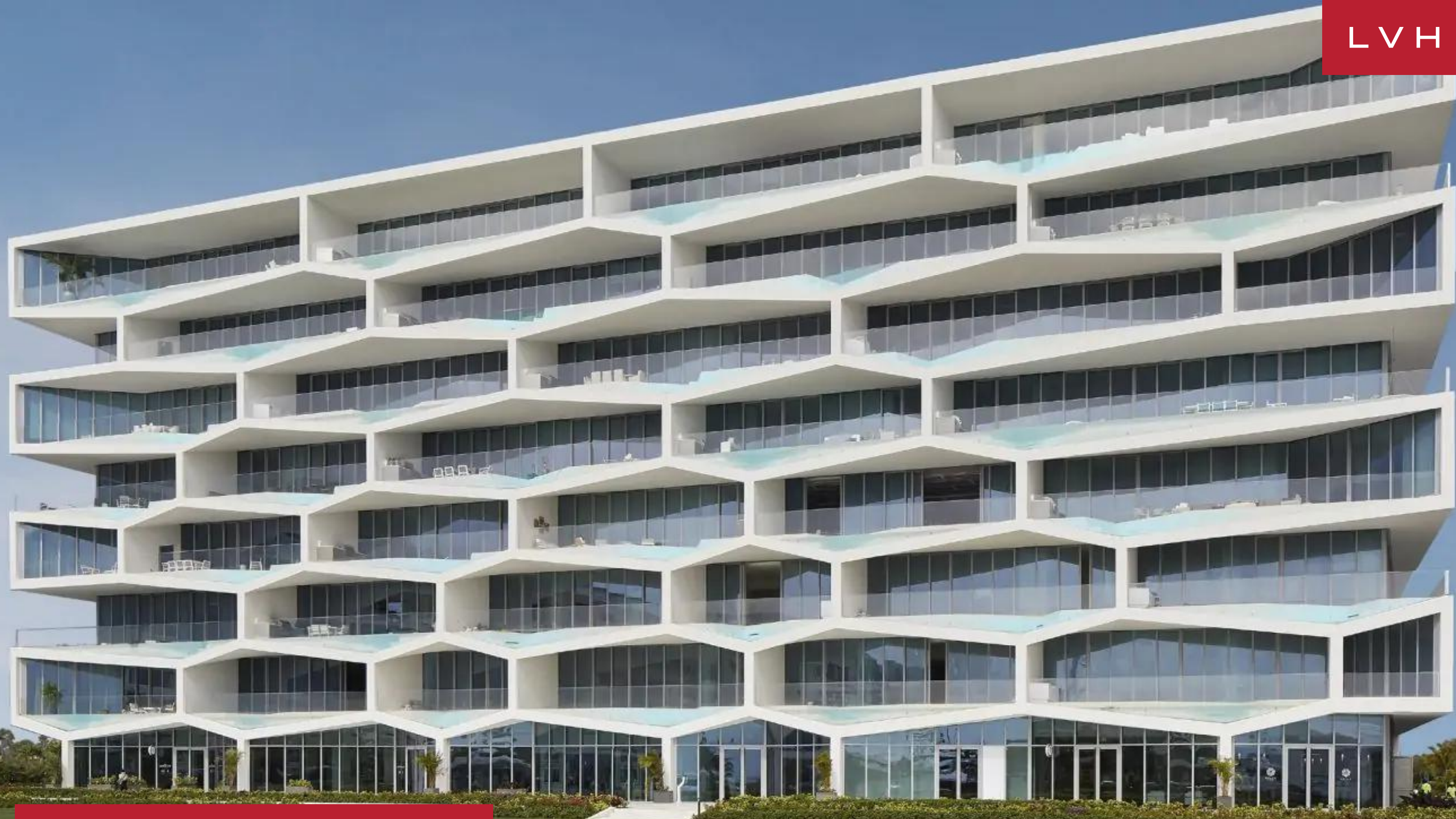
APARTMENT JULIAN ALBANY NEW PROVIDENCE ISLAND, BAHAMAS