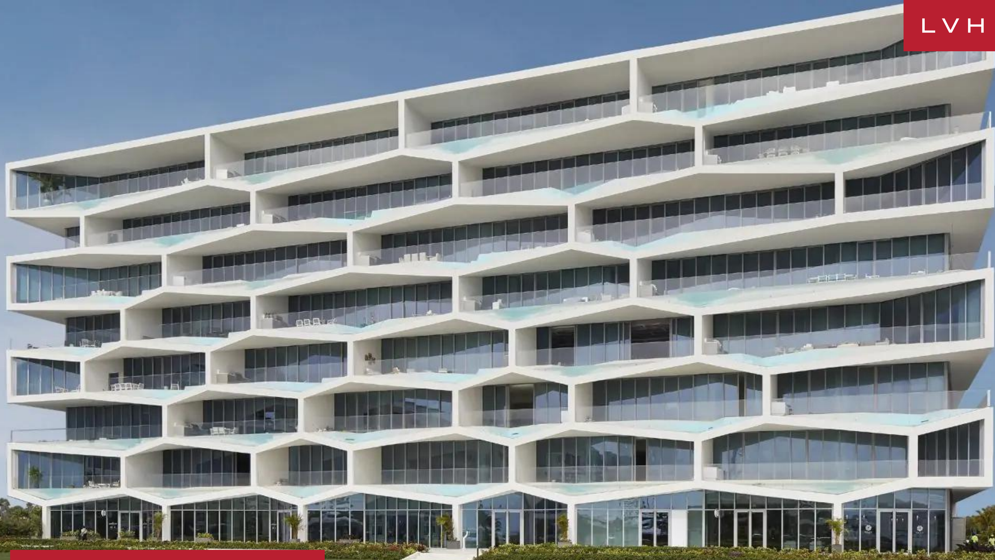
APARTMENT JAMES ALBANY NEW PROVIDENCE ISLAND, BAHAMAS